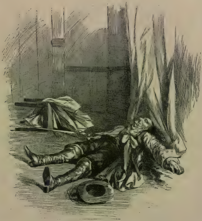
THE BODY OF THE CAPTAIN LAY STRETCHED ON THE FLOOR, SWIMMING IN A SEA OF BLOOD Dumas, Vol. Twenty-two